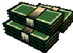
Earn Big Bucks while helping your neighbors to save on their utilities

By building a network of distributors, you can reduce your cost and increase your profits by using our group volume purchase system. How does this work? Anyone that you recruit as a distributor can purchase at wholesale directly from PST. Their volume is added to your accumulated volume and once your total group volume reaches the price breakpoint, your total discount is increased to that next level—which means you can reduce your cost and earn additional income on