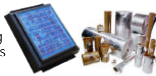
PST Markets Products make a home cooler and saves on utility bills!

We also provide product seminars that you can bring prospective clients to learn more about our products and how they can cool their homes and save money on utilities.